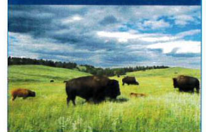
Wildlife enhances the pristine Black Hills