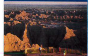
Spectacular Badlands National Park