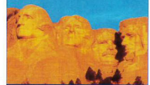
U.S. Presidents immortalized in stone at Mt. Rushmore