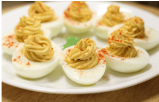
Deviled Eggs

Learn more at USDA Shell Eggs from Farm to Table .