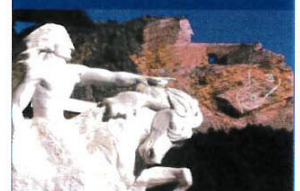
Crazy Horse Monument to be 10x the size of Mt. Rushmore